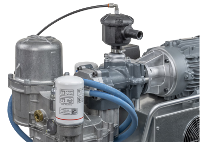
New integrated block